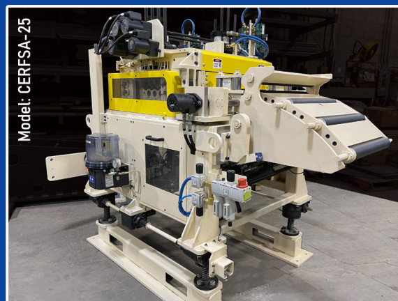
Alligator Head Servo Feeder-Straightener Combo